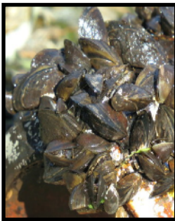
Zebra Mussels

Aquatic invasive species are non-native plants, animals and invertebrates introduced to ecosystems accidentally or intentionally by human activity. Once established, aquatic invasive species are difficult, even impossible, to eradicate. The spread of these species has serious consequences.