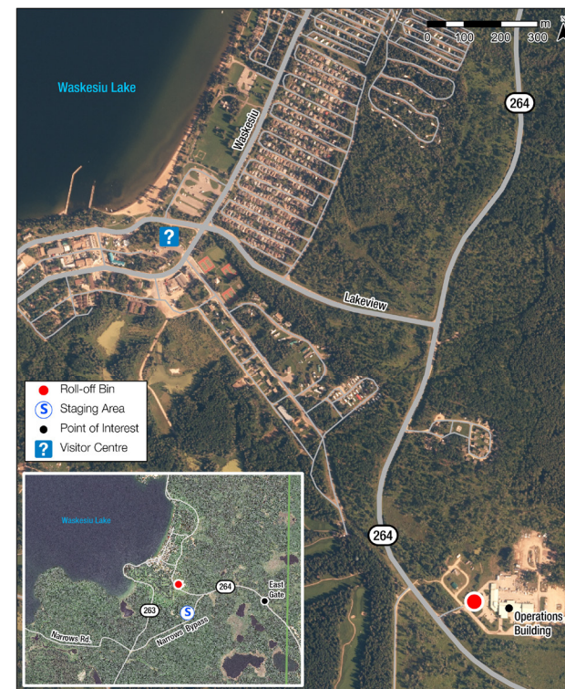
Map of the roll-off bin and staging area locations.

Construction materials or bulky waste can damage waste collection equipment and is a safety risk to park staff. Costs to repair the equipment are included in water/sewer/garbage fees.